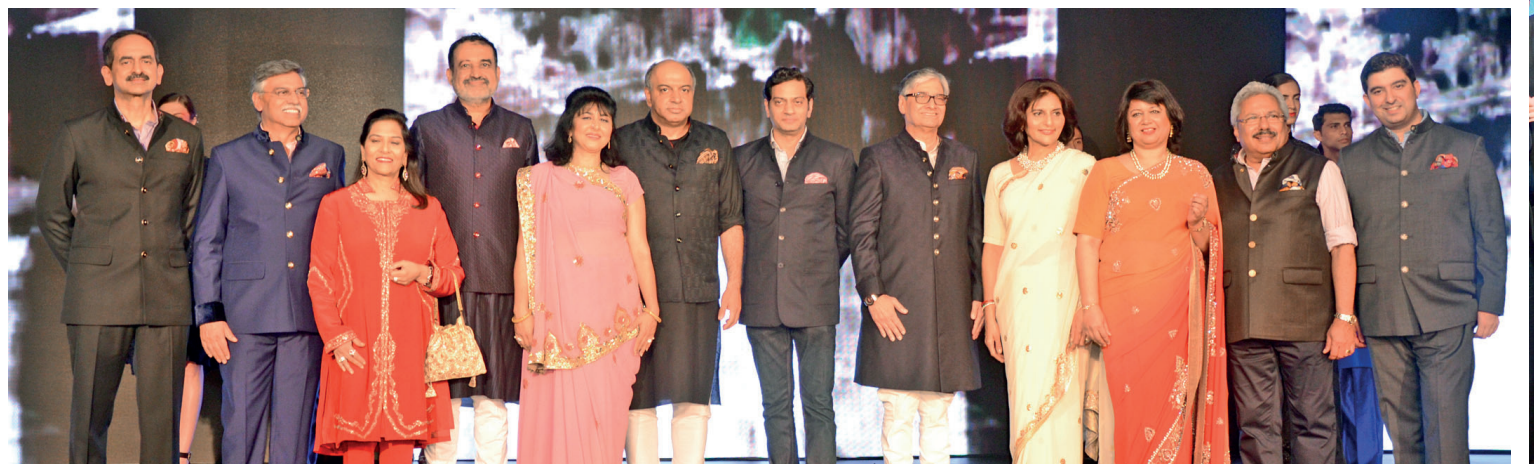
AIMA dignitaries wearing creations of Raghavendra Rathore (centre)