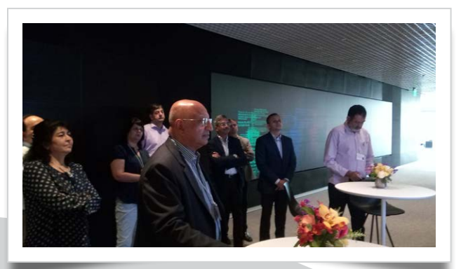
Session at IBM