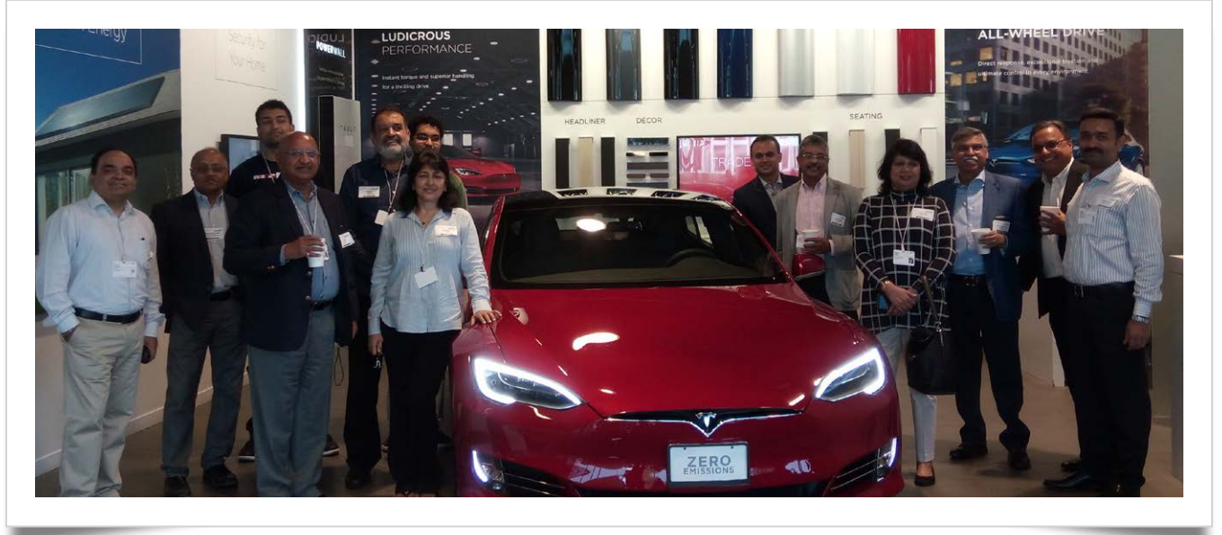
AIMA CEO delegation visit to the Tesla factory