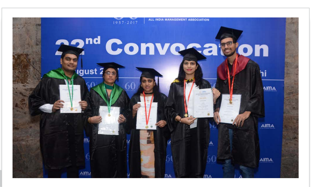
Gold medalists of the batch of 2016