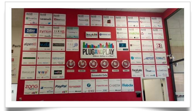
Plug and Play Tech Center