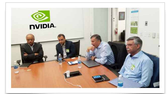
Session at NVIDIA Corporation