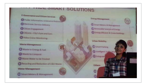
Student member of PMA explaining about IOT based intelligent bin Smart Cities