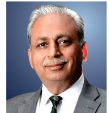
C P Gurnani CEO and Managing Director Tech Mahindra