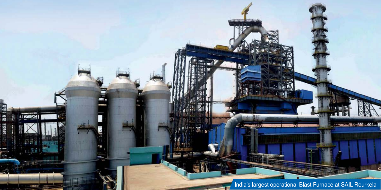
India's largest operational Blast Furnace at SAIL Rourkela