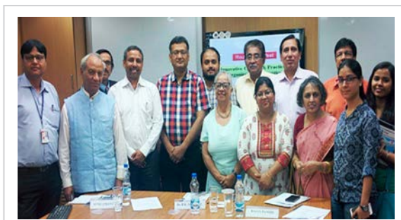
Participants of Round Table meet.