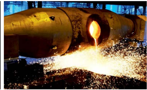
▲ Torpedo ladle at SAIL Rourkela

Maintaining its dominant position in the Indian steel market, SAIL is continually improving to reach new heights of world - class product portfolio with enhanced capacities, backed by sustainable processes & practices.