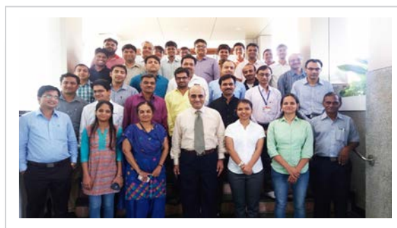
Participants of MDP session.