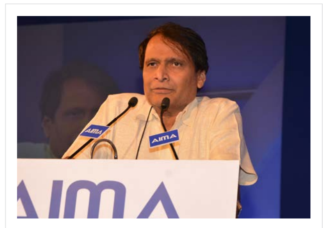
Suresh Prabhu, Minister for Railways, Government of India

AIMA has a fabulous process of selection. All the awardees are from diverse and interesting fields and they have done phenomenal jobs in their spheres, said Mr Suresh Prabhu, Minister for Railways, Government of India. "We have been through various phases since the Independence of our nation. Now we have come to a phase