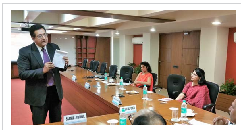
AIMA Certified Trainer (ACT) session in progress

AIMA conducted the first assessment session of AIMA Certified Trainer (ACT) after being endorsed by NOCN, UK on 7th April 2016 at New Delhi.