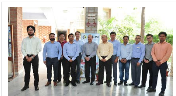
Participants of Management Development Programme