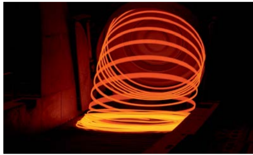
▲ Wire rods at SAIL Burnpur