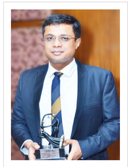
Sachin Bansal, Executive Chairman & Co-Founder, Flipkart; with the Transformational Business Leader of the Year Award