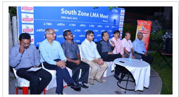
The South Zone LMA meet

The South Zone LMA meet was held on 20th April. Members from seven LMA's took part in this meet, deliberations were done on how to improve the relationship between the LMA's and the need to have joint programmes to strengthen the LMA's.