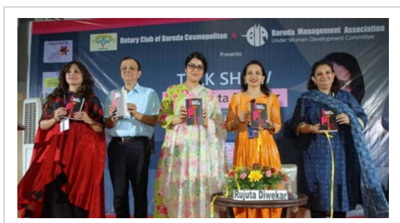
Release of the book ‘Thyroid PCOD’

A book ‘Thyroid PCOD’ authored by Ms. Rujuta Diwekar was also released on the occasion.