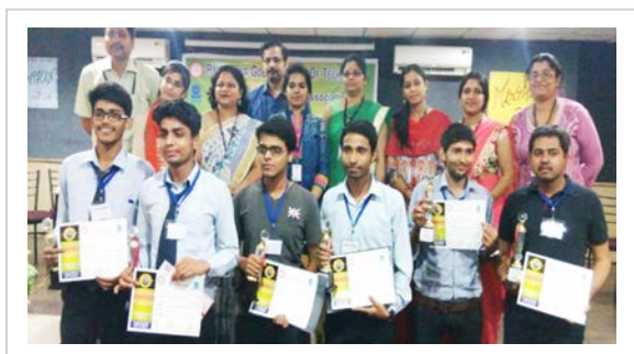
Winning teams of Manthan 2016