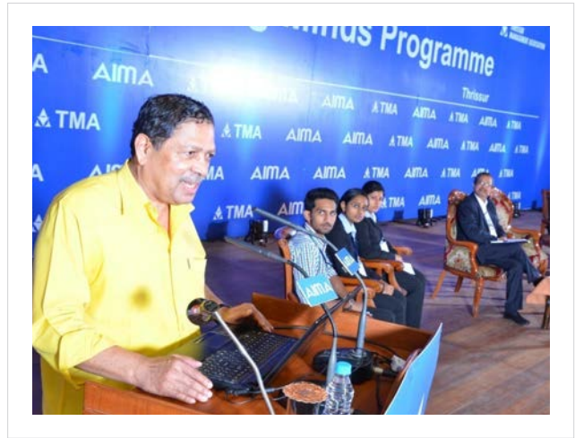
Justice N Santosh Hegde, Former Lokayukta, Government of Karnataka