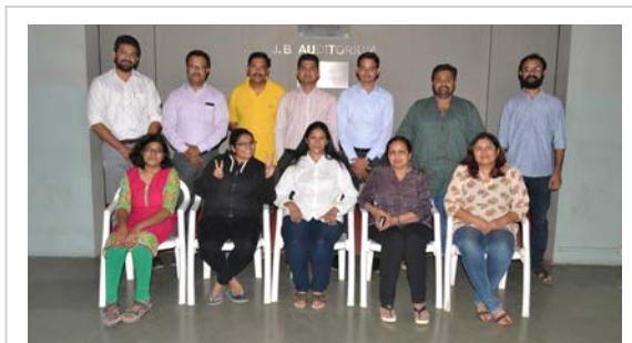
Participants of Copywriting Course

AMA conducted 49 Management Development Programmes this month focusing on Service Tax with Budget 2016 Updates, Copywriting, E-Commerce for Small Entrepreneurs, Brand Management, Employability Enhancement Endeavour, Effective Cost Management, First Aid Training, Certificate Programme on Exports and Imports, Research Design, Project Management, Hi-impact presentation skills etc.