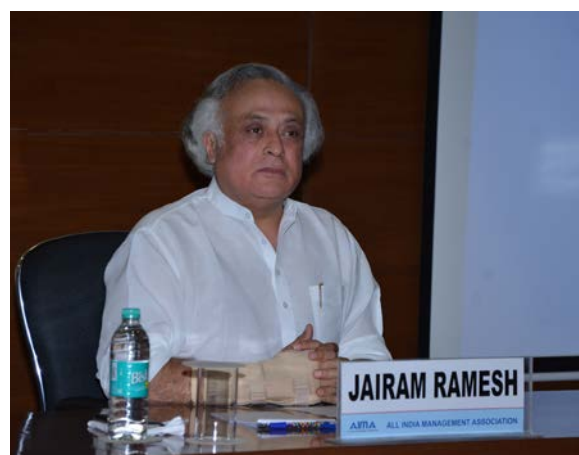
Jairam Ramesh, Member of Parliament