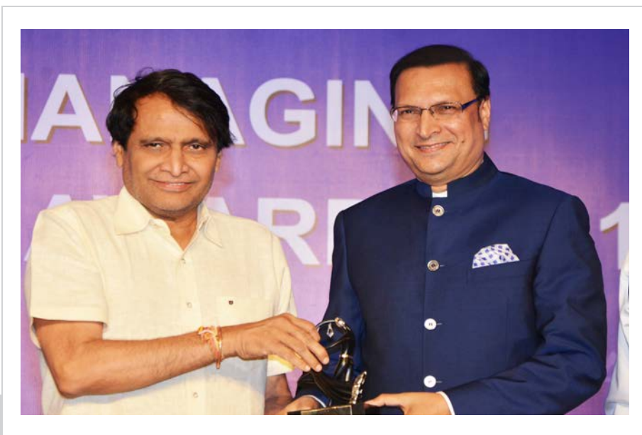
Rajat Sharma, Chairman & Editor-in-Chief, India TV, receiving the Outstanding Contribution to Media Award from Suresh Prabhu

Recipient of the Outstanding Contribution to Media award, Mr Rajat Sharma, Chairman & Editor-in-Chief, India TV,