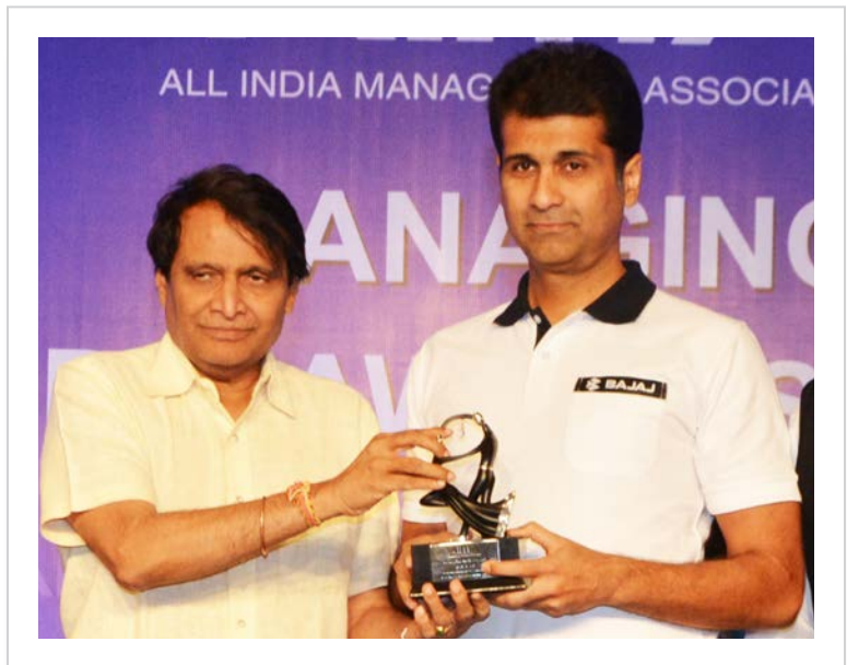
Rajiv Bajaj, Managing Director, Bajaj Auto Ltd, receiving the Business Leader of the Year Award from Suresh Prabhu, Minister for Railways, Government of India