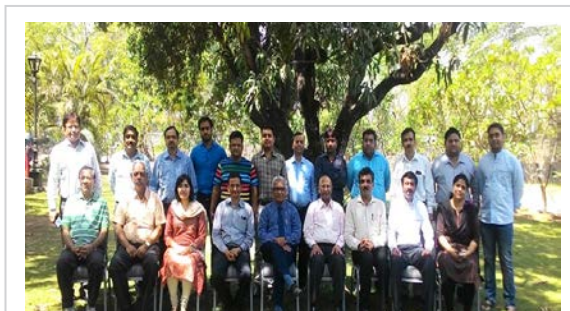
Participants of Leadership Retreat 2016.

The Baroda Management Association organised the leadership retreat 2016 on the theme ‘Making India Manager’ from 11-13 April at the Daman Ganga Valley. The MDP focused on understanding the changed global business scenario, its impact on the organisation and enhancing managerial competence. The programme was well received by the participants.