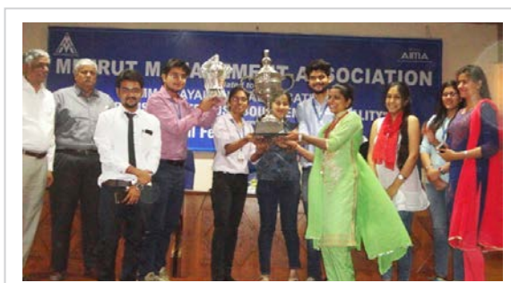
The winning teams with their trophies

MMA organised Annual Dayal Debate on ‘India Is Not Serious about Gender Equality’ on 19th April. 18 teams of students from various engineering and management colleges from Meerut and nearby places took part. MIT Education was the winner while JP School of Business and MIET Engineering were the 1st and 2nd runners up.