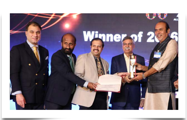
Kerala Management Association winner of Best LMA Award 2017 - Category I I