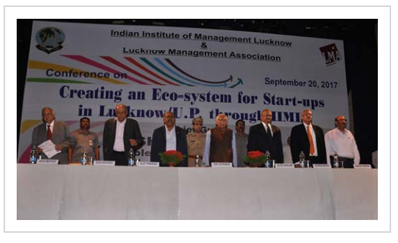
Conference on 'Creating an Eco-system for Start-ups in Lucknow/Uttar Pradesh'

Policy makers, start-ups/mentors, venture capitalists and angel investors interacted with students of various institutions, start-