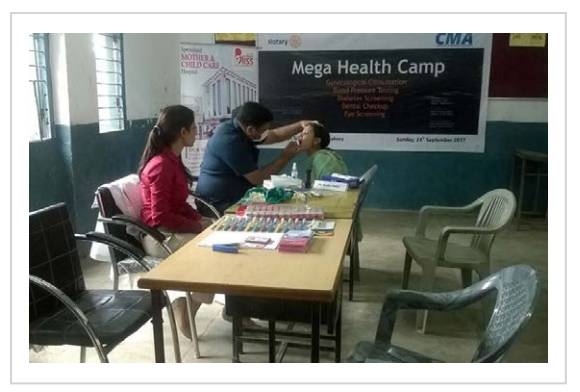
Doctors attending to patients during Mega Health Camp