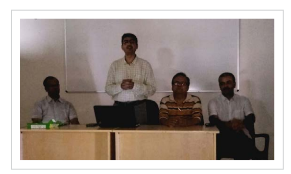
RMA representatives addressing

With an aim to engage students with real business world, RMA invited students studying B. Voc from Drona foundation to attend a seminar on 'Industry - Institute Partnership for improve employability of students: Collaborate or Collapse' organised by RMA. Response from these future entrepreneurs and CEOs was tremendous. Noticing their enthusiasm, Team RMA went to their institute and explained how RMA can be a bridge to fill the gap of academics and real life applications and other activities of RMA.