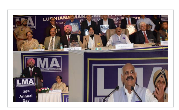
39th Annual Day Function Ceremony