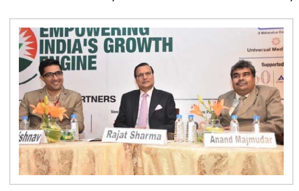
Speakers at the Valedictory session