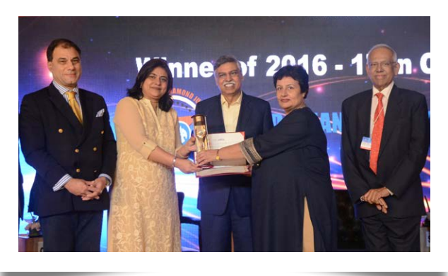
Baroda Management Association winner of Best LMA Award 2017 - Category III