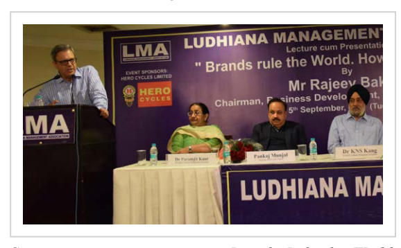
Seminar cum presentation on 'Brands Rule the World, How to Build Yours'