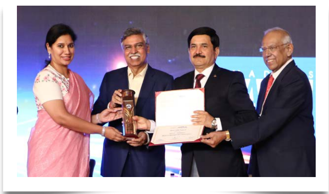
Madras Management Association winner of Best LMA Award 2017 - Category I

LMAs in various categories. Winning LMAs were presented their awards during the Diamond Jubilee NMC. PricewaterhouseCoopers were the knowledge partners.