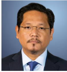
Conrad Sangma Chief Minister Government of Meghalaya, India