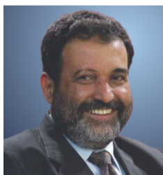
T V Mohandas Pai Chairman, Manipal Global Education Services