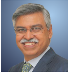
Sunil Kant Munjal Chairman, AIMA International and Chairman The Hero Enterprise