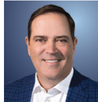
Chuck Robbins* Chair and CEO Cisco Systems Inc.