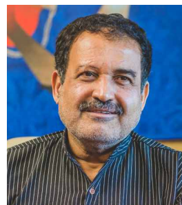
Mr T V Mohandas Pai Chairman, Manipal Global Education Services Private Limited and Past President, AIMA