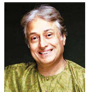
Ustad Amjad Ali Khan Sarod Maestro