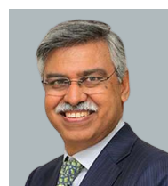
Sunil Kant Munjal Chairman Hero Enterprise