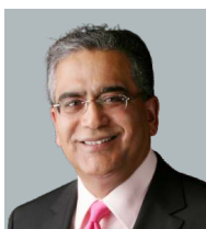
Aron Purie Founding Chairman & Editor-in-Chief The India Today Group