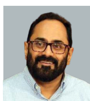
Rajeev Chandrasekhar Hon'ble Minister of State for Electronics & IT and Skill Development and Entrepreneurship, Government of India