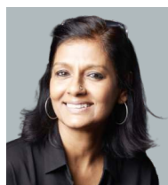
Nandita Das Indian Actress and Film Maker