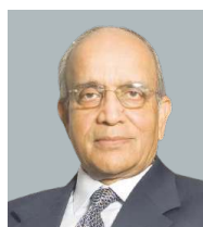
R C Bhargava Chairman Maruti Suzuki