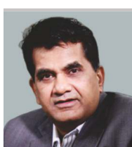
Amitabh Kant India's Sherpa for the G20