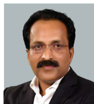
S. Somanath Chairman, Indian Space Research Organisation (ISRO)