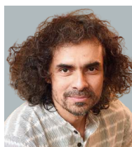
Imtiaz Ali Indian Film Director Producer and Screenwriter