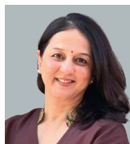
Rohini Nilekani Chairperson, Rohini Nilekani Philanthropies