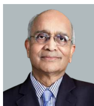
R C Bhargava Chairman Maruti Suzuki