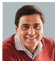
Ronnie Screwvala Co-founder and Chairperson, upGrad, Indian Entrepreneur and Film Producer