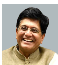
Piyush Goyal Hon'ble Minister of Commerce & Industry, Consumer Affairs, Food & Public Distribution, Textiles and Leader of the Rajya Sabha, Government of India