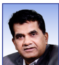
Amitabh Kant G20 Sherpa of India Government of India