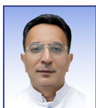
Jitin Prasada Minister of State for Commerce & Industry; Electronics & IT, Government of India