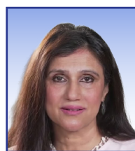
Rina Dhaka Fashion designer