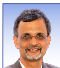
V Anantha Nageswaran Chief Economic Advisor Government of India