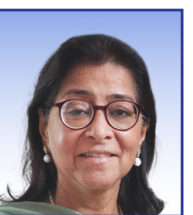
Naina Lal Kidwai Chairperson Rothschild & Co India