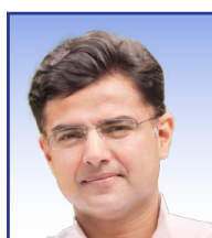
Sachin Pilot National General Secretary INC & Member of Rajasthan Legislative Assembly & Former Cabinet Minister Government of India