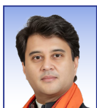
Jyotiraditya M. Scindia Minister of Communications Development of North Eastern Region, Government of India