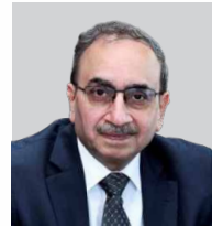
State Bank of India Dinesh Kumar Khara, Chairman