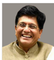
Piyush Goyal Minister of Commerce & Industry Consumer Affairs & Food & Public Distribution and Textiles, Government of India and Leader of House, Rajya Sabha