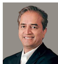
Devi Prasad Shetty Chairman and Executive Director, Narayana Health