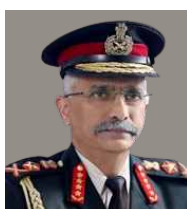
General MM Naravane PVSM, AVSM, SM, VSM, ADC Chief of the Army Staff Indian Army