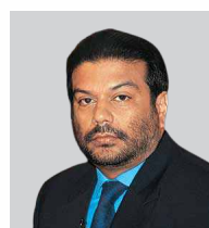
Vir Sanghvi Indian Print and Television Journalist, Author, Columnist and Talk Show Host