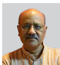
Shekhar Gupta Editor-in-Chief and Chairman, The Print