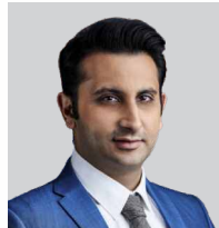
Adar Poonawalla CEO, Serum Institute of India