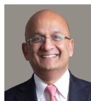
Nitin Nohria Distinguished Service University Professor, Harvard University and Former Dean, Harvard Business School