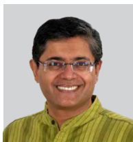
B J Panda National Vice-President & spokesperson, Bharatiya Janata Party (BJP)