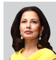
Ritu Beri Indian Fashion Designer