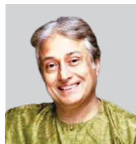
Ustad Amjad Ali Khan Renowned Indian Classical Sarod Player