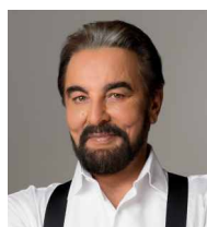
Kabir Bedi Indian Film Actor