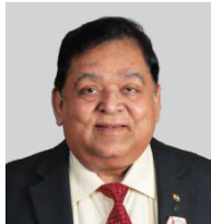
A M Naik Group Chairman, Larsen & Toubro Ltd