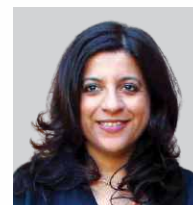
Zoya Akhtar Film Director and Writer