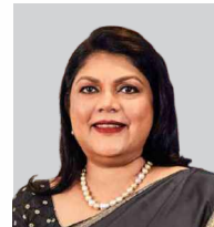
Falguni Nayar Founder & CEO, Nykaa E-Retail Pvt Ltd