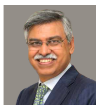
Sunil Kant Munjal Chairman Hero Enterprise