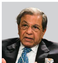
N K Singh Indian politician, economist and former Indian Administrative Service officer