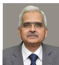
Shaktikanta Das Governor Reserve Bank of India