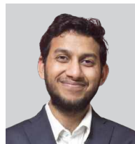
Ritesh Agarwal Founder & Group CEO, Oyo Rooms