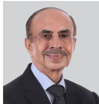
Adi Godrej Chairman, Godrej Group