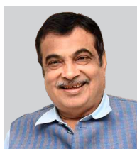
Nitin Gadkari Minister for Road Transport & Highways Government of India