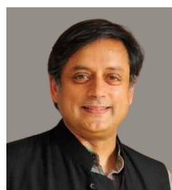
Shashi Tharoor Member of Parliament, Lok Sabha and Chairman of the Parliamentary Standing Committee on IT