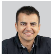
Bhavish Aggarwal Co-Founder & CEO, Ola Cabs