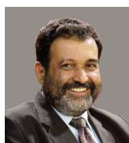
T V Mohandas Pai Chairman Manipal Global Education Services Pvt Ltd