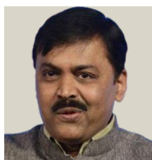
GVL Narasimha Rao Member of Parliament- Rajya Sabha (BJP), Psephologist and Author