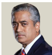
Rajdeep Sardesai Consulting Editor India Today group