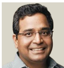
Vijay Shekhar Sharma Founder, Paytm