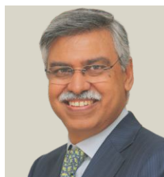
Sunil Kant Munjal Chairman The Hero Enterprise