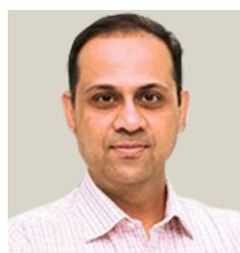
Sanjiv Bajaj Managing Director Bajaj Finserv