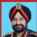
General Bikram Singh, PVSM (Retrd.) Former Chief of Army Staff Indian Army