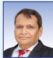
Suresh Prabhu Former Cabinet Minister & Leadership Mentor & Global Strategist and Policy Architect