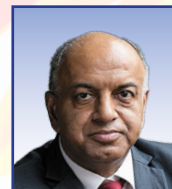
Sanjeev Bikhchandani Founder & Executive Vice Chairman, Info Edge India Ltd