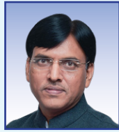
Mansukh Mandaviya Minister of Labour & Employment Youth Affairs & Sports Government of India