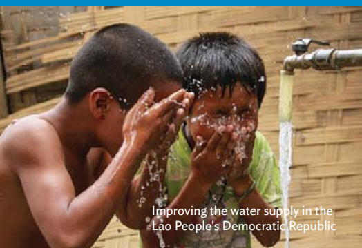
Improving the water supply in the Lao People's Democratic Republic

What we do: ADB helps to develop the region and its people by working with governments and private companies, providing women and girls more opportunities, supporting good government practices, and partnering with people and groups across society. ADB's work focuses on infrastructure; the environment, including climate change; regional cooperation and integration; financial sector development; education; and health.