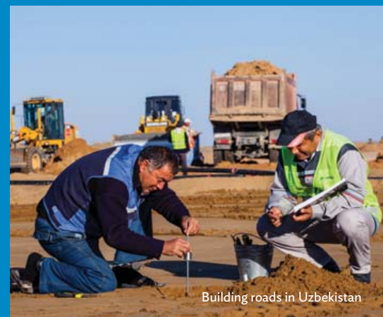
Building roads in Uzbekistan

What we do: ADB helps to develop the region and its people by working with governments and private companies, providing women and girls more opportunities, supporting good government practices, and partnering with people and groups across society. ADB's work focuses on infrastructure; the environment, including climate change; regional cooperation and integration; financial sector development; education; and health.