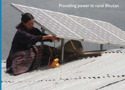
Providing power to rural Bhutan

Why we matter: The Asia and Pacific region is on the move. Rapid economic growth over the past 20 years has lifted more people out of poverty than ever before. But the impressive gains mask a range of issues that are holding people back from reaching their full potential. These include a growing gap between the rich and poor, environmental degradation, risks arising from climate change, a lack of infrastructure, and persistent poverty in many areas.